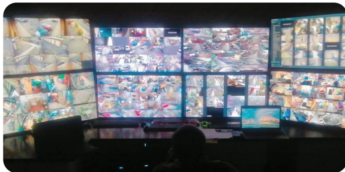
VISUAL FROM OUR FACILITY

OUR SECURITY SPECIALISTS ARE ALWAYS WATCHING YOUR BUSINESS FOR YOU.